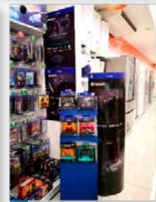
Socio Gaer Dedicated Setup